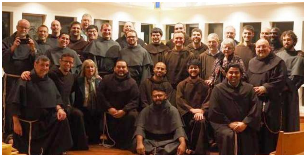
Gathering of the Capuchin, Conventual and OFM novices for Epiphany. We were hosted by the Conventuals at San Juan Capistrano Friary/Novitiate, Arroyo Grande, California.