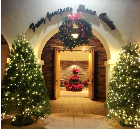
Entrance of Serra Center, San Luis Rey Parish, Oceanside, California.