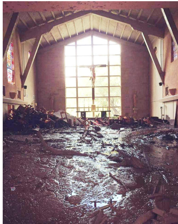
Above: Chapel, La Casa de Maria, Montecito, California.

The Mudslides in Santa Barbara are devastating - 100 homes destroyed - 300 in unsafe condition - 8 business destroyed - 20 in unsafe condition - 17 fatalities - 28 in hospitals many in critical condition - 17 or more unaccounted for - Highway 101 closed from Milpas to Highway 150 until at least Monday afternoon - There are still integrity questions about the Highway 101 - Please pray for all the families.- This is just the beginning - Search and Rescue cannot get to some areas by foot or trucks. The mud is just too deep and there are too many boulders - Helicopters flying all day for fuel and rescues - The first responders have done an amazing job - also keep them in your prayers - Blessings Lisa