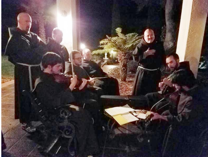
Above: Gathering of the Three Branches for Epiphany. We are grateful for these brothers.