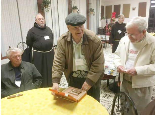
his cigar collection.